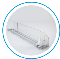
MPT - Pusher tray widths 60–100 mm