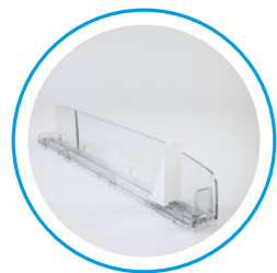
MPTN - Pusher tray narrow widths 40–57,5 mm