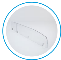
MPT-DIV - Divider